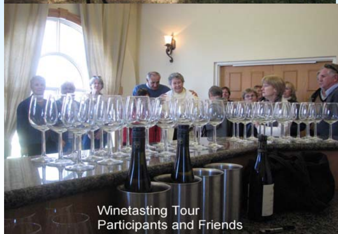
Winetasting Tour Participants and Friends