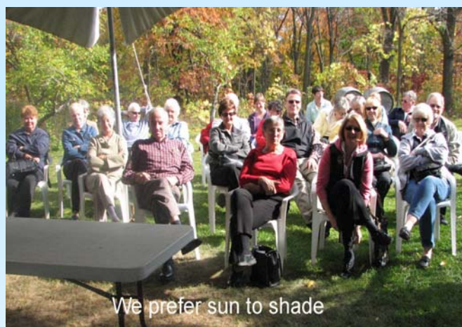
We prefer sun to shade

A big yellow bus, 35 half awake people and a whole day ahead. It was a great day with lots of fall sights, sunshine, laughter and delicious wine tasting. It couldn't have turned out better. We shopped the tourist street in Jordan, visited and toured some interesting wineries and had a catered lunch at Hernder Estates. Our Stoney Ridge winery visit which offered shopping in the boutique and gourmet cheese shop, put us behind schedule by thirty minutes, as several were in their glory buying up their favourites by the carton! I don't know how we will follow this one up next year.